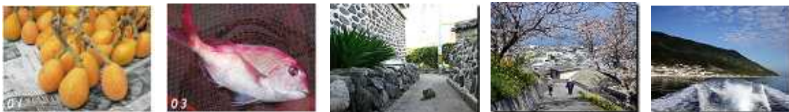
Pictures: Some were offered by the Association for the Conservation of Nagashima Island, The others were provided by the people of Iwaishima .

* Viewing spots : Stonewalls, cherry blossoms, Kokkoh (a fruit that has legendary anti-aging power), Gyohja-doh (a small shrine sacred to Enno Ozune )